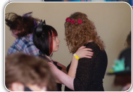
We Are Family’s participants celebrating at the 2022 Queer Youth Prom

“While our mental health services continue to be the area of greatest impact with our technology, our youth have found a new way to utilize our tablets! Our youth enjoy playing group video games like ‘Among Us’ and Jackbox TV. Kids who don’t have access to the technology required (i.e. a cell phone or tablet) have been able to participate in a more meaningful way. In a way, it has broken down an economic barrier between kids that we were previously unable to overcome. Before we had access to this tech, those kids without phones or tablets were included, but it was clear to them that they weren’t able to participate in the capacity they’d like to. Something as simple as playing a game of ‘Among Us’ together has brought our kids closer to one another in a way a million small group discussions or anything else for that matter never could.”